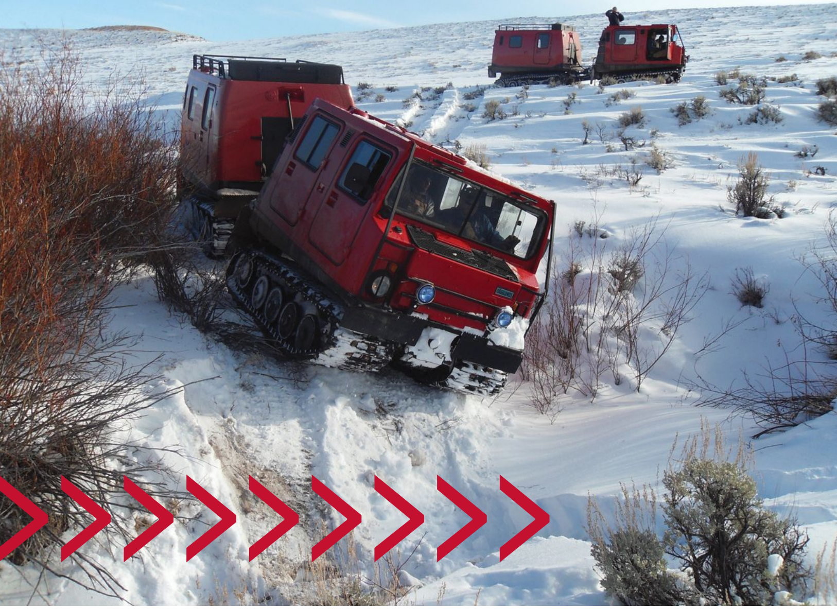
Ensure that the vehicles employees use to travel over snow are properly inspected and maintained per manufacturer recommendations. Mechanical breakdowns are among the leading causes for survival situations.