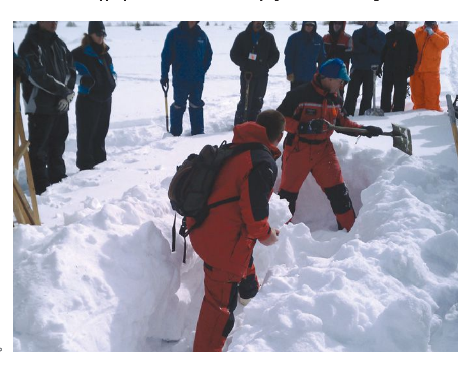
An analysis should be performed to determine which survival items will be most appropriate for the areas that employees will be traveling to.

When choosing first aid supplies, avoid preassembled kits. Gauze pads, roller bandages, tape packs and Betadine — a topical antiseptic — don't take up much space. They can be used to treat small cuts, and >>